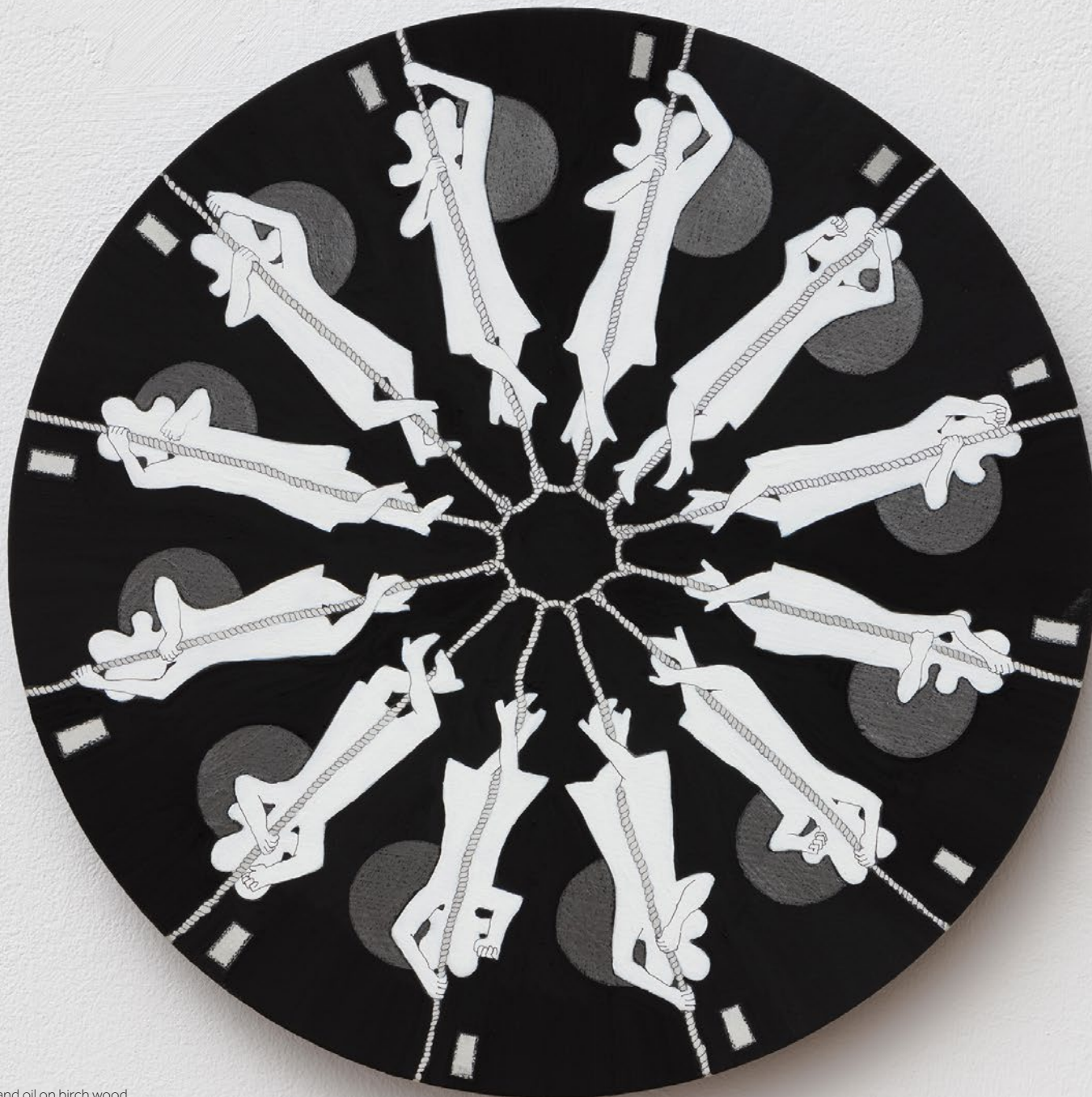
Reign of the Idle Hands #1 , 2019 Graphite, charcoal, pastel, ink, acrylic, and oil on birch wood 12 in. (30.5 cm) diameter