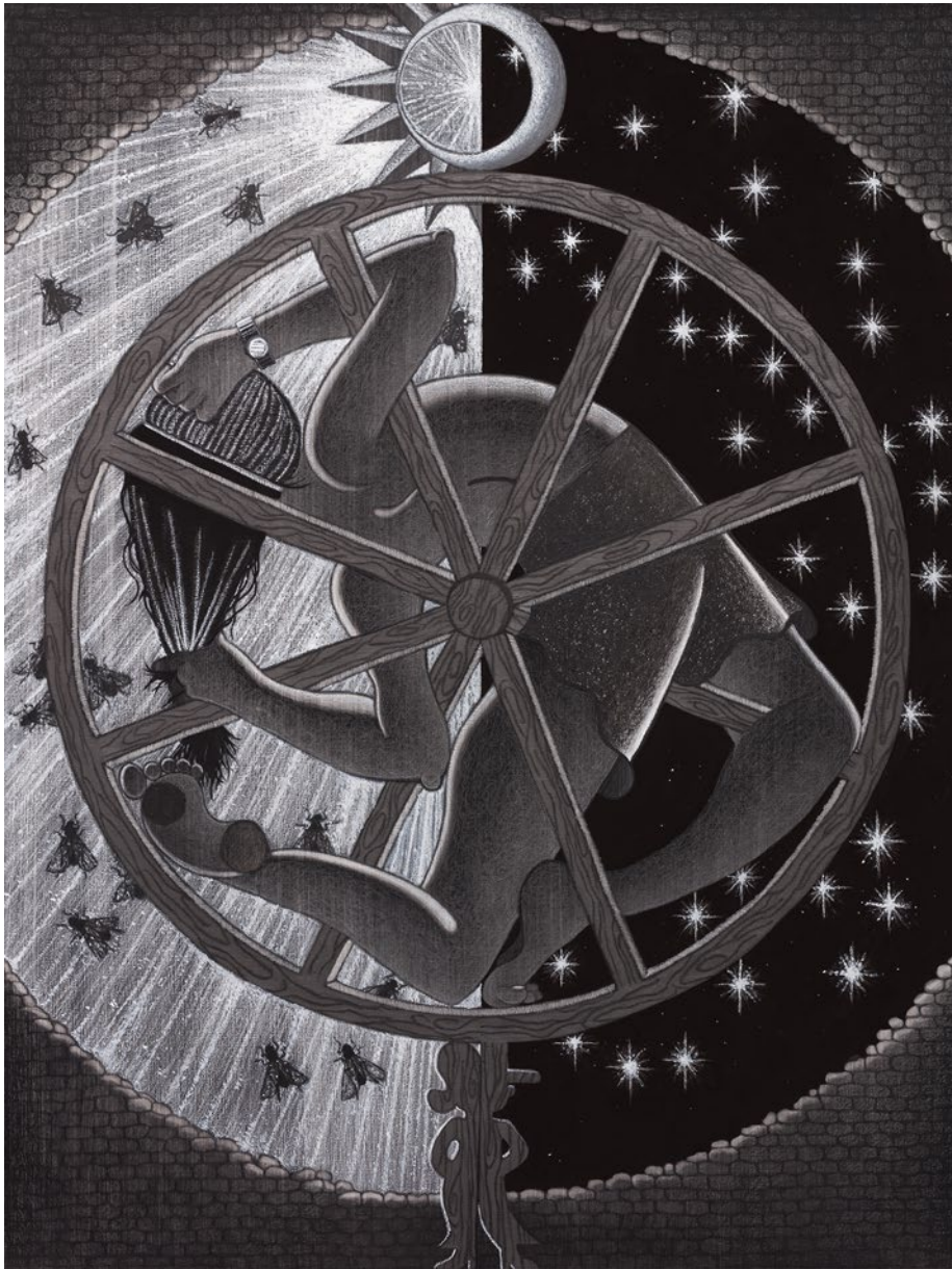
8 Hours of Slumber, Labor & Leisure, 2020 Oil, acrylic, ink, graphite, charcoal on canvas and birch 64 × 48 in. (213.3 × 162.6 cm), double sided