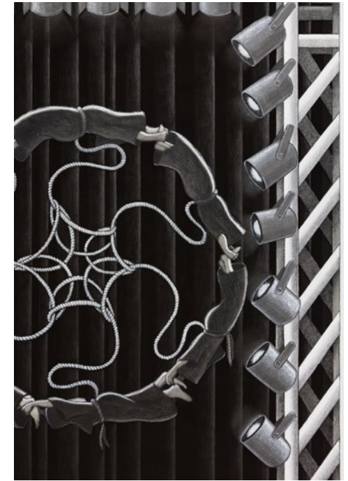
Yearnings of the Flesh , 2019 (detail) Graphite, charcoal, pastel, ink, acrylic, and oil on canvas 84 × 64 in. (213.3 × 162.6 cm)

Curiously absent from Kim's new works is The Schoolgirl. The typical subordinate to the pervasive, disciplinary authority of Mister Capital and Madame Earth is only glimpsed in Yearnings of the Flesh . If not The Schoolgirl, who do the parents exist to discipline;