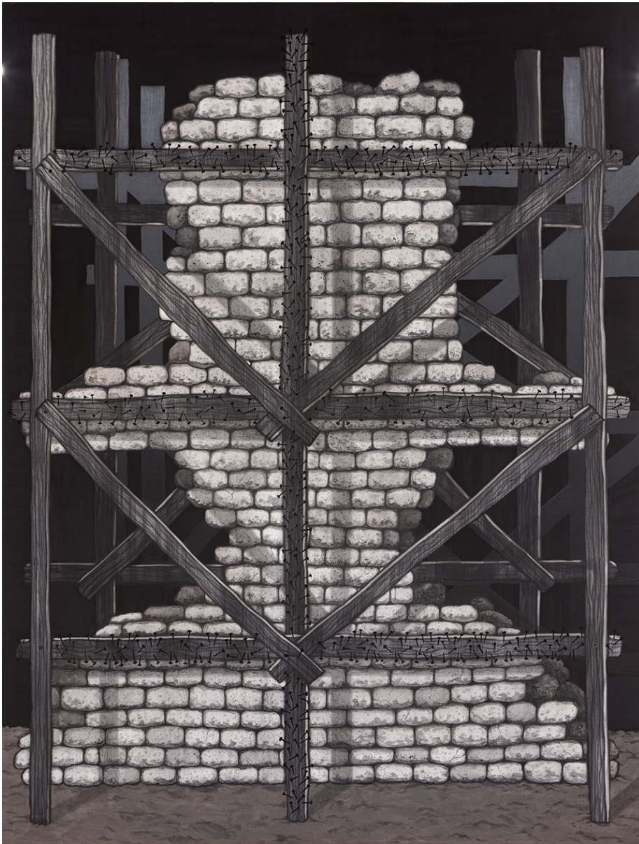
Mister Capital , 2019 (front view of double-sided work) Oil, acrylic, ink, pastel, graphite, charcoal on canvas and birch 84 × 64 in. (213.3 × 162.6 cm)

source materials for additional meanings. Circles and wheels, for instance, are found throughout Kim's recent work and integrate references to illusory vision and to fate. Reign of the Idle Hands #1 (2019) [cover image] belongs to a series of round paintings informed by the phénakistoscope, an early animation disc that when rotated around a central axis gives the illusion of movement to the images drawn on its surface. In these works, Kim disables the kinetic apparatus central to its concept. Instead, the painting is stable, and bears the repeated form of Madame Earth in frustrated attempts to scale a rope—each illustration a fragment of what, if activated, would be a cohesive motion. Echoing this design on a larger canvas, Yearnings of the Flesh (2019) features a circular procession of cloaked and rope-bound schoolgirls who spookily float, ouroboros-like, within an arbor formed by a theatrical lighting rig. Found in Medieval illuminated manuscripts like the Carmina